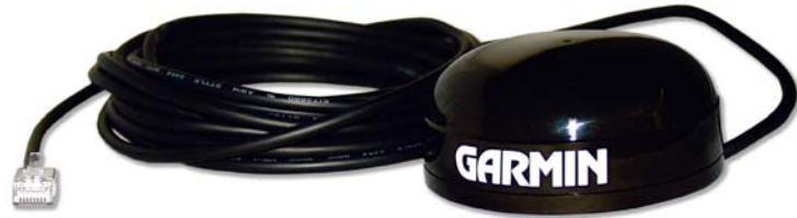
FIGURE 1. Garmin 16-HVS GPS Receiver, Part Number 17215